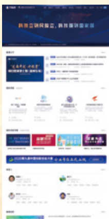
Chinese Website 中文网站