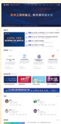
Chinese Website 中文网站