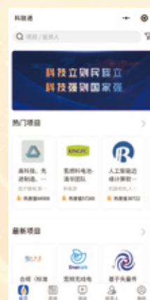
WeChat Mini-Programs 微信小程序