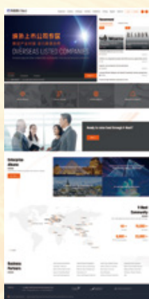
English Website 英文网站