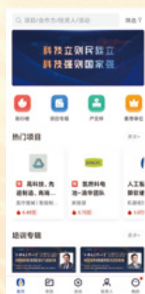
Chinese App 中文APP